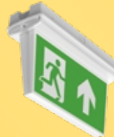
Part No: 430391 Drop Accessory